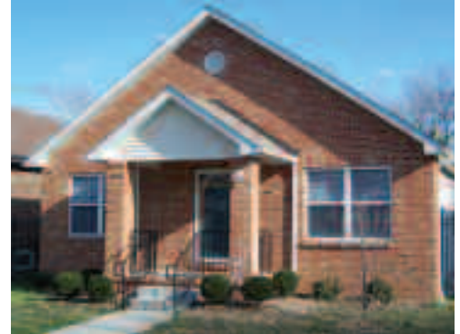
Ruskin Town Homes • 14 units

The St. Louis Equity Fund raises capital on an annual basis from financial institutions and corporations, and invests this capital in affordable and historic rental housing units by purchasing federal and state tax credits. Approximately 50% of these credits are purchased from not for profit general partners who are addressing the most critical housing needs in the many communities that they serve. The tax benefit generated from the purchased tax credits are then allocated to the investors, providing them a market rate of return on their investment. Since 1988, the St. Louis Equity Fund has facilitated the raising of more than $157 million of capital which has been invested in approximately 2,900 housing units with a total development cost of $307 million.