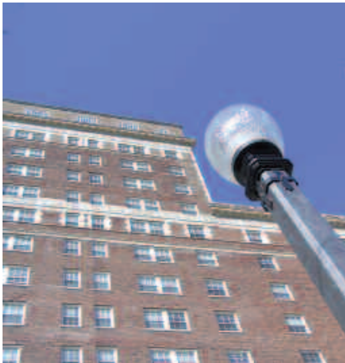
Coronado Place • 165 units

below the tax credit income limit, which for a family of four is $39,540. As the need for work force housing continues to grow, the St. Louis Equity Fund will be there to assist in meeting the demand.