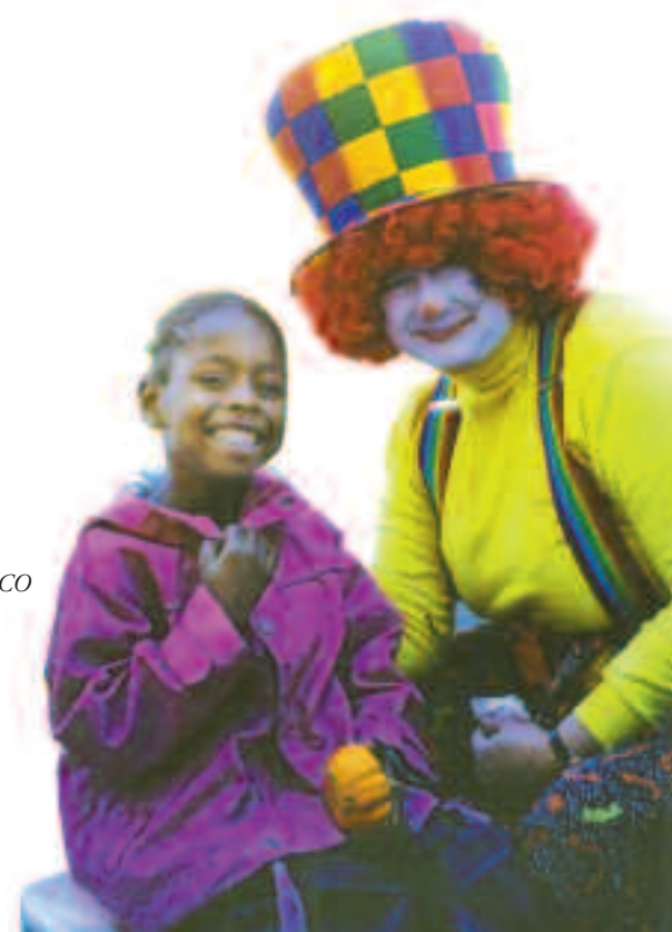
A resident enjoys the festivities at a CAMCO Open House.