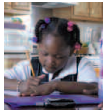
A young Ville Estates resident works on homework in her family's new home.