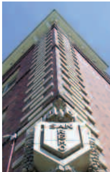
FP San Remo • 75 units

In addition to making a financial investment, the investors also make a serious investment of their time and talents to the governance of the St. Louis Equity Fund. Whether through serving on the Board of Directors or serving on one of the four standing Committees of the Board, this group of experienced, thoughtful professionals provide the guidance and insight to ensure the safe and sound operation of the Funds.